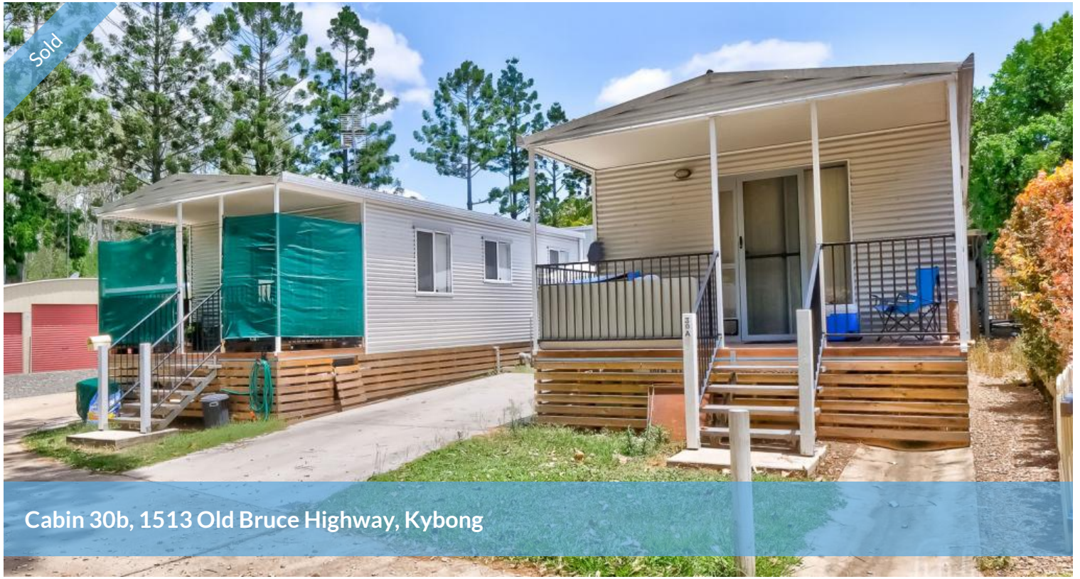
Cabin 30b, 1513 Old Bruce Highway, Kybong