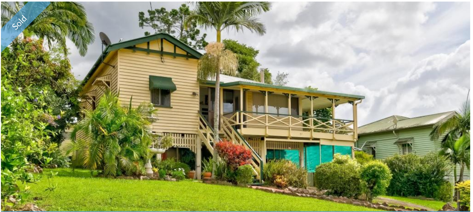
27 Elizabeth Street, Kenilworth