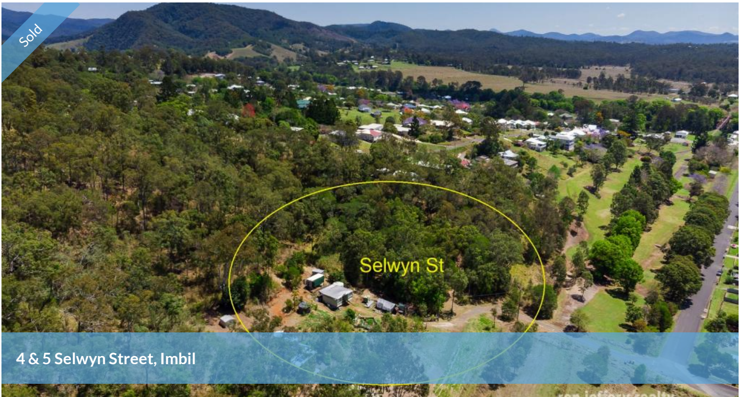
4 & 5 Selwyn Street, Imbil