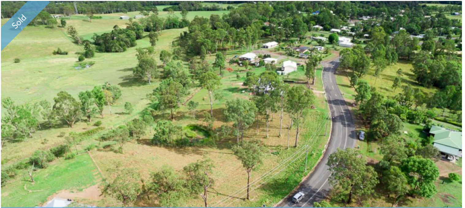
Lot 4 Kandanga Amamoor Road, Amamoor