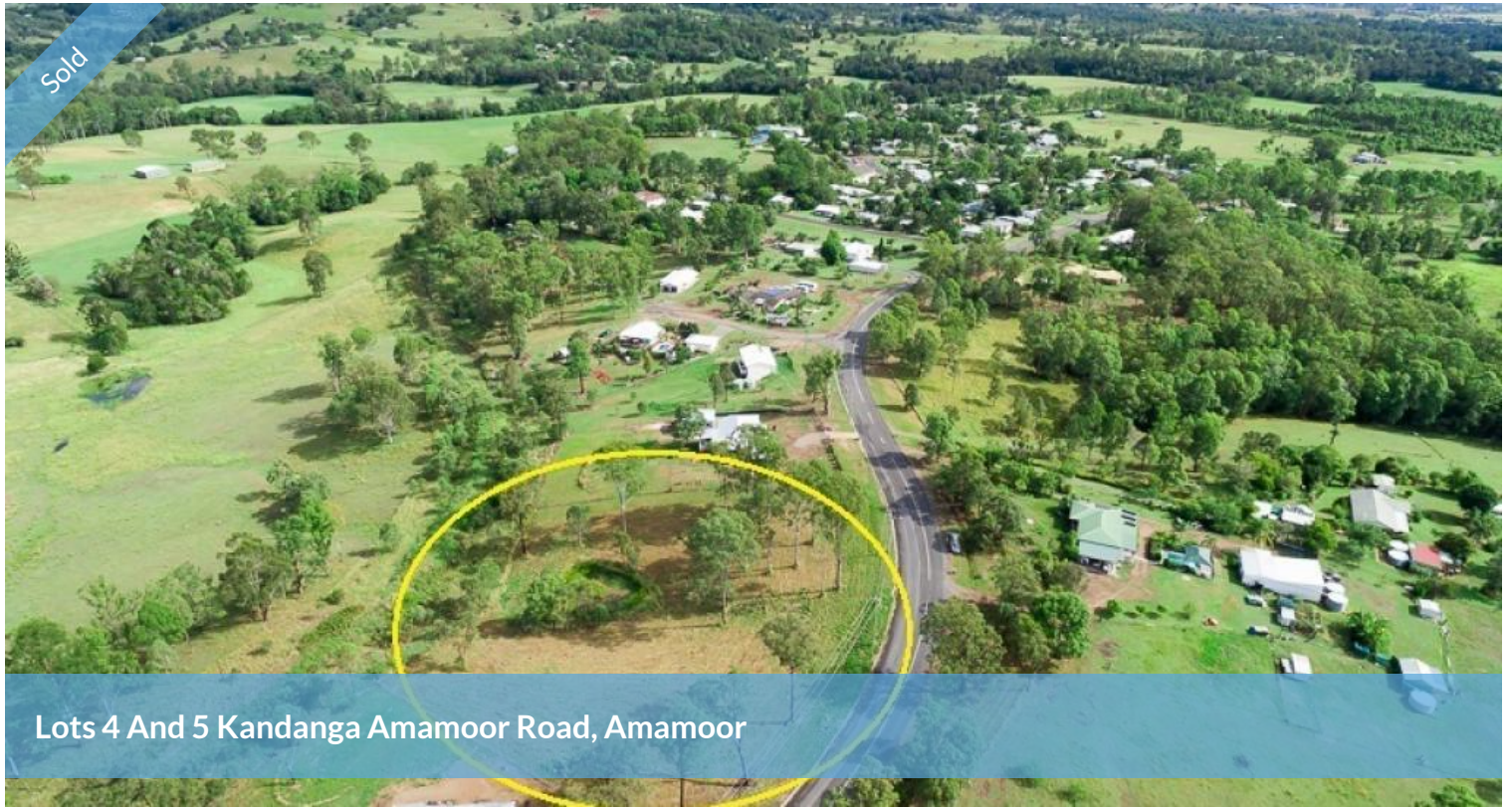
Lots 4 And 5 Kandanga Amamoor Road, Amamoor