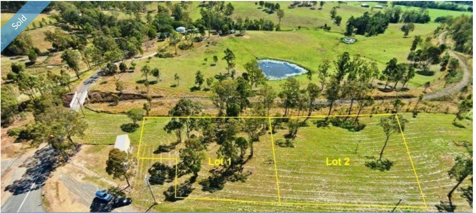
Lot , Lot 2 Kandanga-Amamoor Road, Amamoor