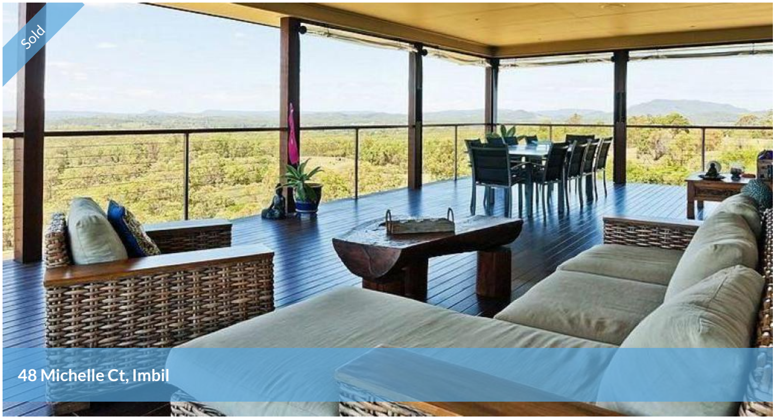
48 Michelle Ct, Imbil