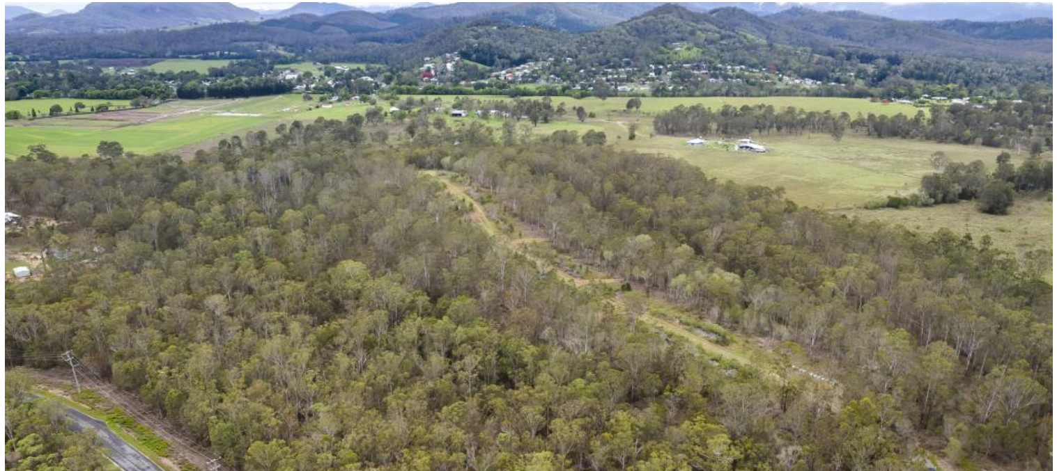
Lot 4 Tiffany Road, Imbil